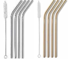
Smoothie Straw Silver Item no. 9669 Gold Item no. 9690