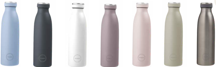
Powder Blue 500 ml Item no. 9997