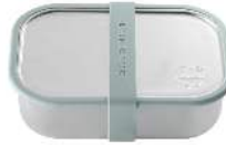
Mint Green 1000 ml Item no. 9256