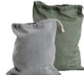
Tropical Green / Dark Grey Item no. 9553