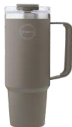
Driftwood 885 ml Item no. 1794