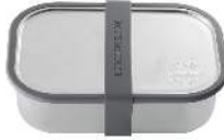
Dark Grey 1000 ml Item no. 9287