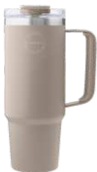
Cream Beige 885 ml Item no. 1787