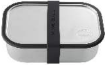
Matte Black 1000 ml Item no. 9294

Lunch Box is perfect for school, office or on the go. 100% leakproof when fully closed. Made of food-grade 18/8 stainless steel and platinum silicone. Flexible divider included. AYA&IDA Lunch Box is laboratory certified to meet LFGB (food contact grade testing).