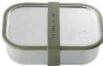
Tropical Green 1000 ml Item no. 9263