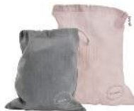
Soft Rose / Dark Grey Item no. 9539