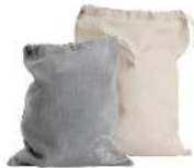
Cream Beige / Dark Grey Item no. 9560