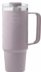
Lavender 885 ml Item no. 1756

Thermo Cup with Straw is our spacious to-go cup, which holds 885 ml. The cup keeps drinks cold for 12 hours and iced for 36 hours. It is a spacious to-go cup with a straw and handle, ensuring your hydration needs are met while on the go. Drink water, juice, smoothies, and other cold beverages through the straw in the lid. If you want to use it for hot drinks, use the small opening in the lid. Thermo Cup with Straw is made from premium 18/8 stainless steel, while the lid is made from Tritan, and the straw from platinum silicone. Thermo Cup with Straw is laboratory certified to meet LFGB (food contact grade testing).