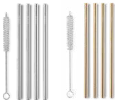
Short Straw Silver Item no. 9652 Gold Item no. 9591

Avoid single-use straws with reusables that can be used again and again. Made of 1st class stainless steel 18/8. Easy to clean - all straws are dishwasher safe. AYA&IDA straws are laboratory certified to meet LFGB (food contact grade testing). Straws come in a bag with a small cleaning brush.