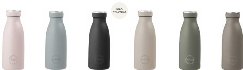
Soft Rose 350 ml Item no. 9706