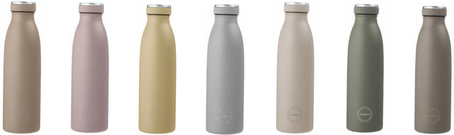
Dusty Brown 500 ml Item no. 1947