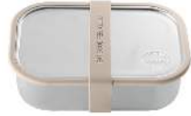
Cream Beige 1000 ml Item no. 9270