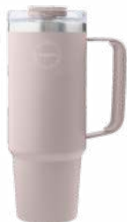
Soft Rose 885 ml Item no. 1770