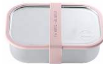
Soft Rose 1000 ml Item no. 9249