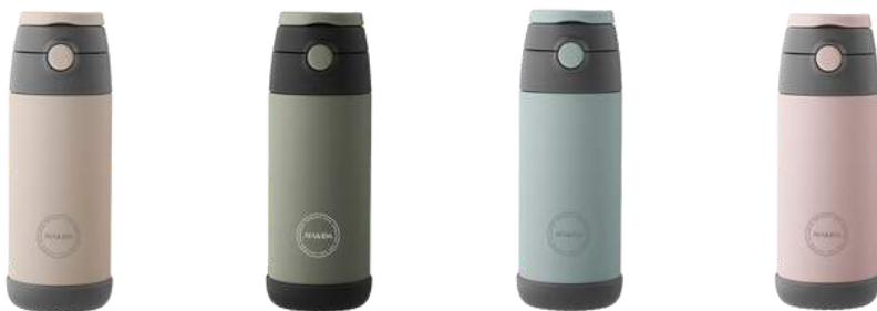
Cream Beige 350 ml Item no. 9928