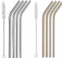
Drinking Straw Silver Item no. 9621 Gold Item no. 9683