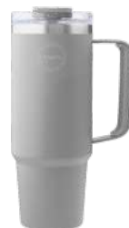
Light Grey 885 ml Item no. 1800