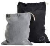
Matte Black / Dark Grey Item no. 9966

Set with 2 Reusable Cotton Bags in 100% organic cotton. It is a reusable alternative to disposable plastic bags. The size of the bags are perfect for all AYA&IDA products, and make it easy to pack all your things together when you're on the go.