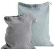
Mint Green / Dark Grey Item no. 9546