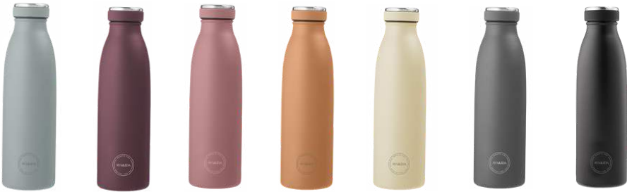
Mint Green 500 ml Item no. 9126