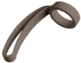
Bottle Handle Driftwood Item no. 1572