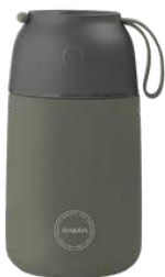
Tropical Green 700ml Item no. 9065