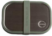
Tropical Green 1000ml Item no. 9263