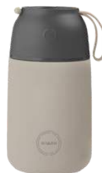
Cream Beige 700ml Item no. 9072