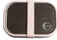
Soft Rose 1000ml Item no. 9249