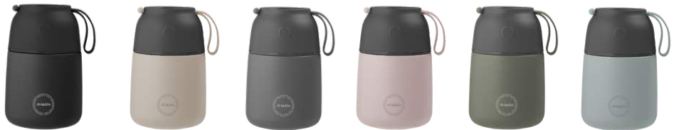
Matte Black 500ml Item no. 9089