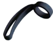
Bottle Handle Navy Blue Item no. 1589