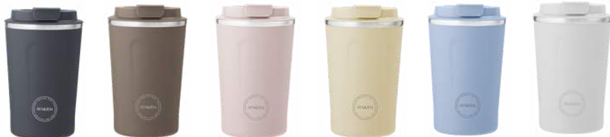
Navy Blue 380ml Item no. 1336