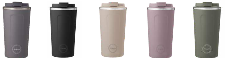
Dark Grey 500ml Item no. 9867