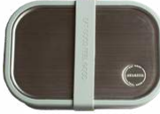
Mint Green 1000ml Item no. 9256