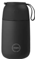
Matte Black 700ml Item no. 9096