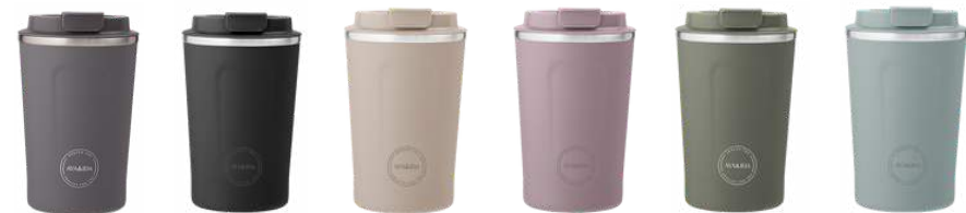
Dark Grey 380ml Item no. 9874