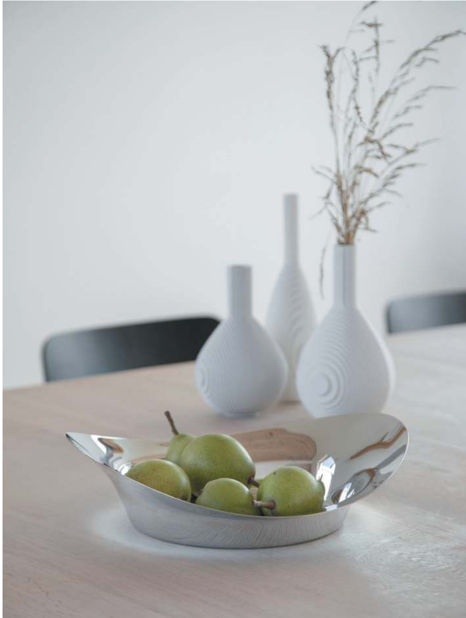
Circle Bowl by Finn Juhl