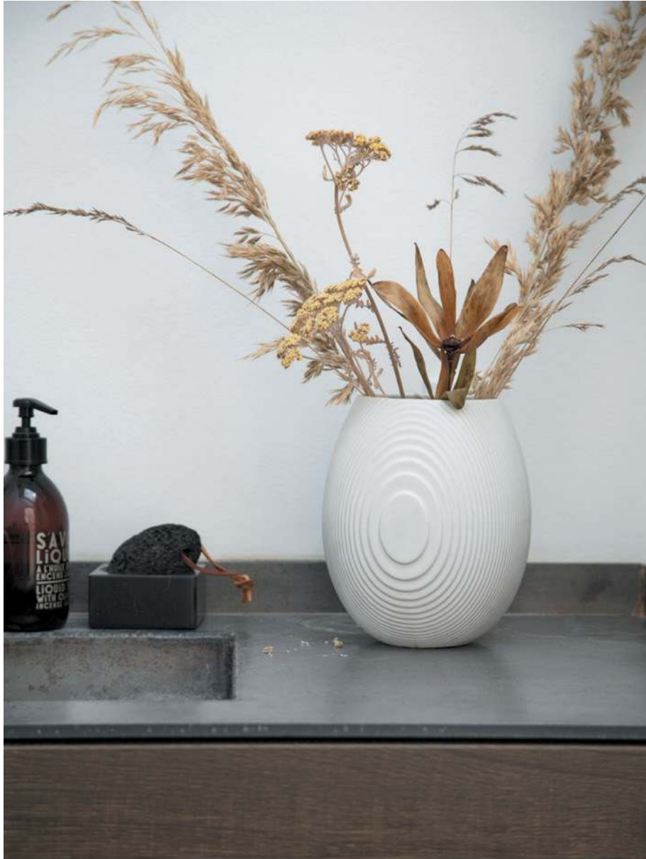
Ornament Series by Vibeke Rytter