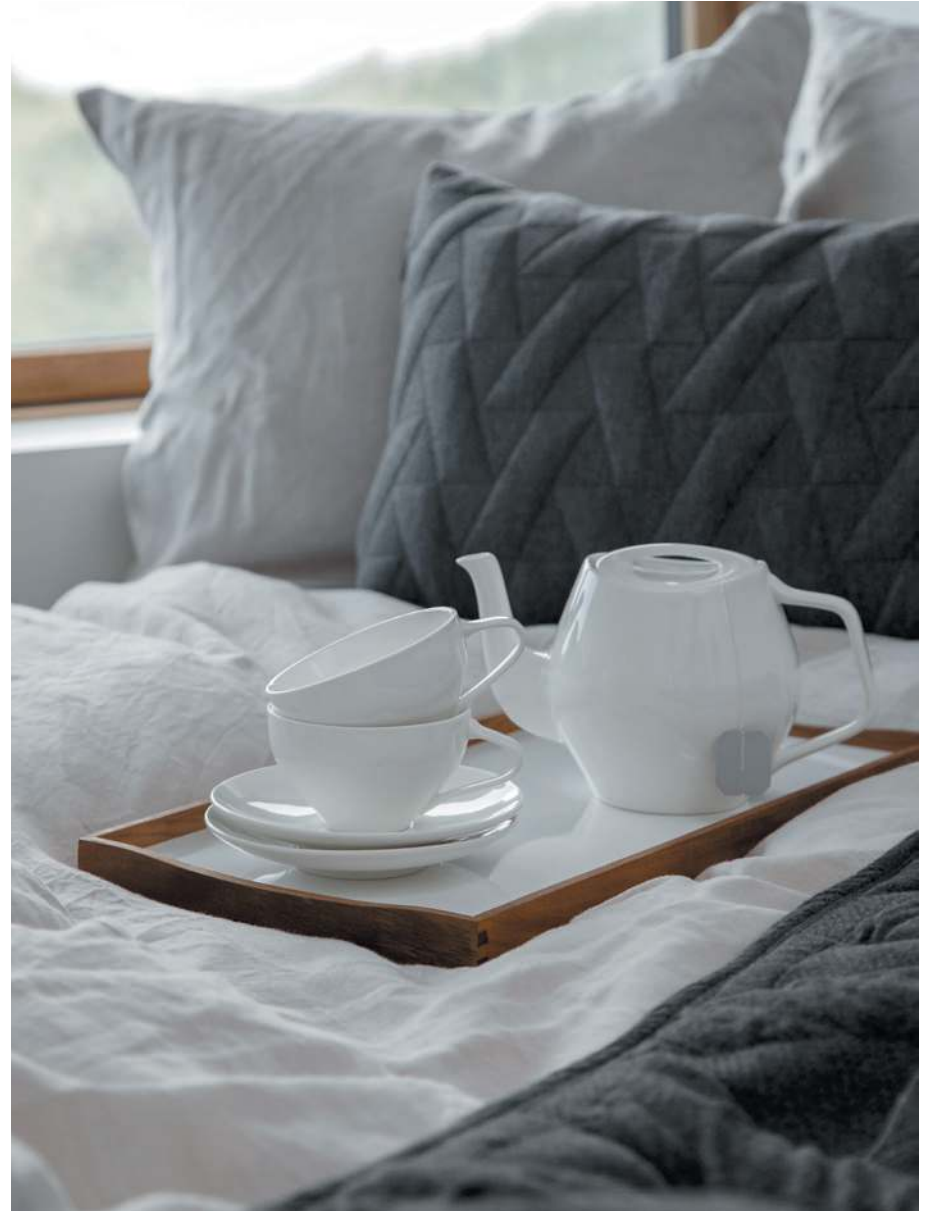
FJ Pattern, FJ Essence and Turning Tray by Finn Juhl