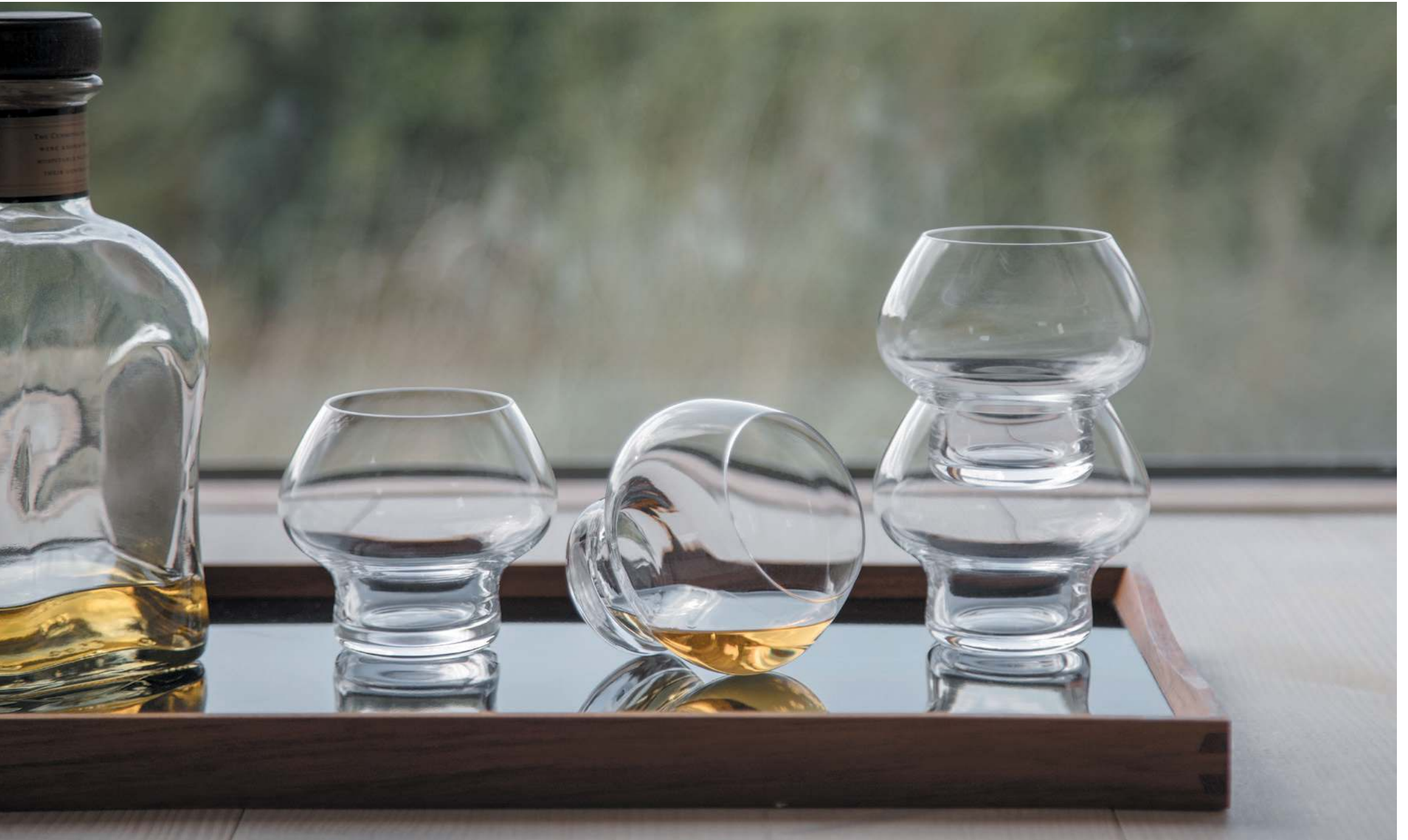
Spring by Jørn Utzon