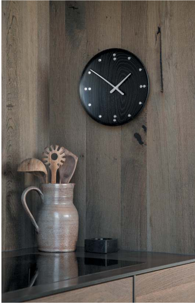
FJ Clock by Finn Juhl PK-Mini by Poul Kjærholm