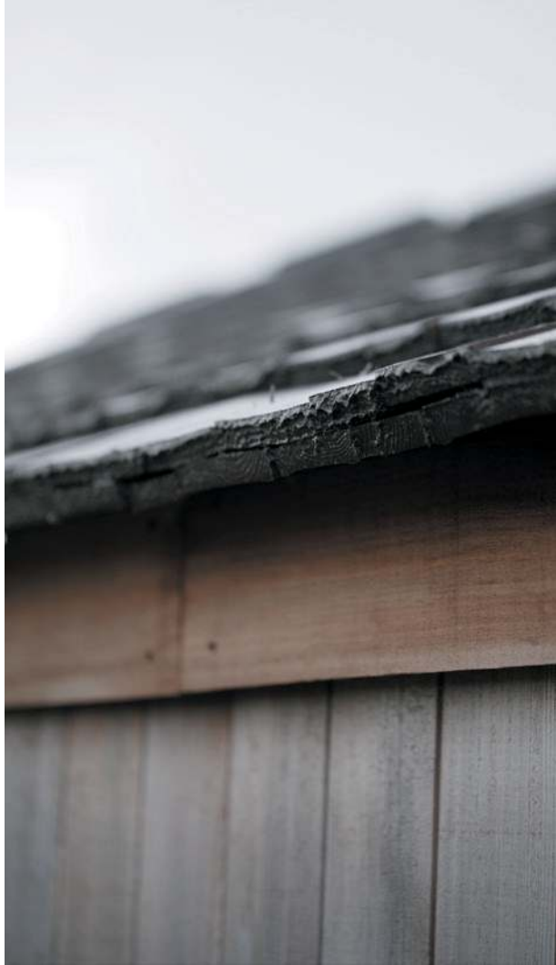
FJ Pattern by Finn Juhl