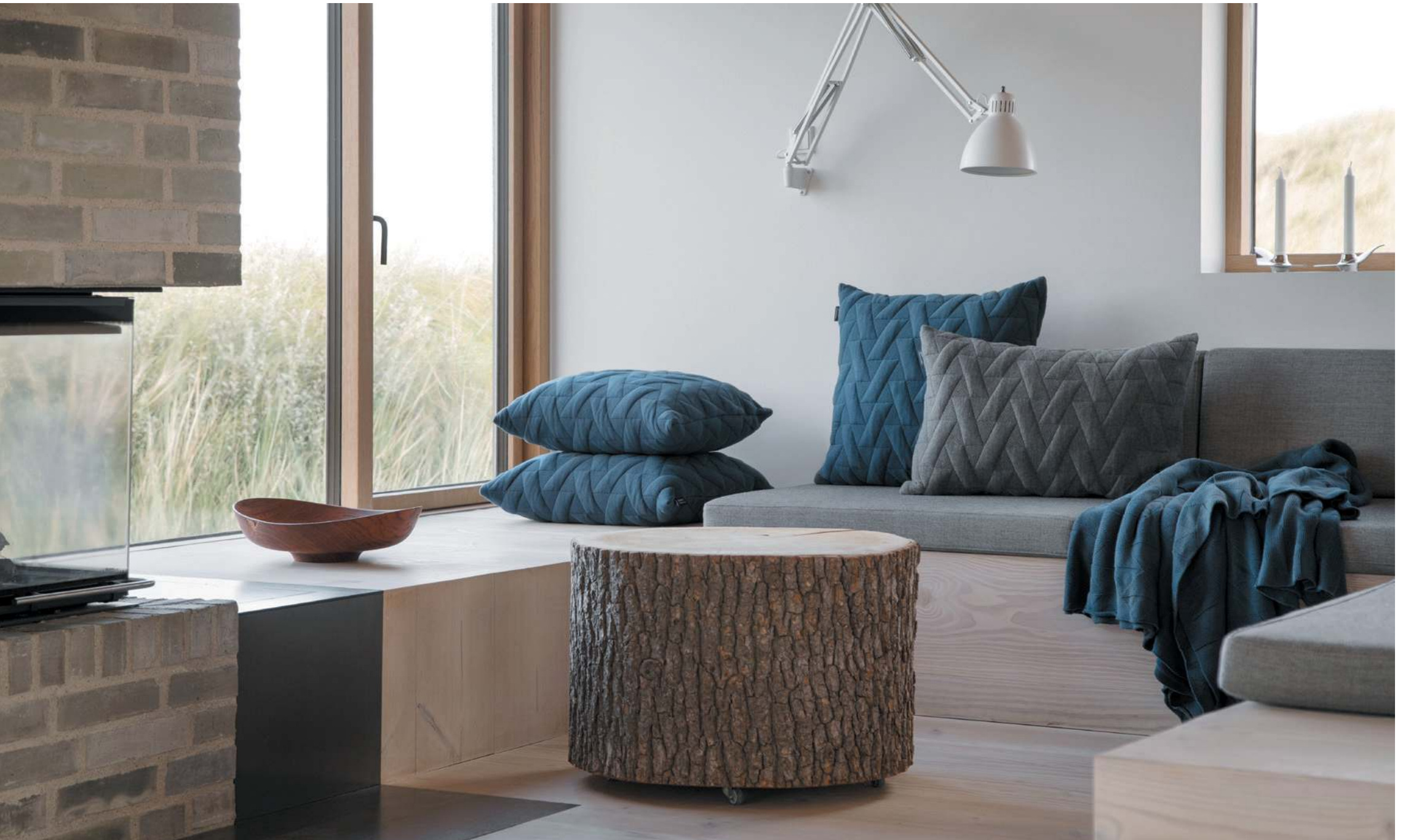
FJ Bowl and FJ Pattern by Finn Juhl